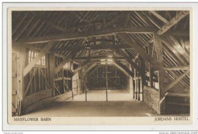
Interior of the Mayflower Barn - Internet Photo

We may never be able to visit this unique barn for ourselves, but it will always be known as the Mayflower Barn.