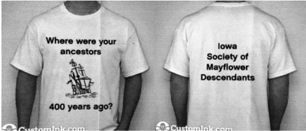
Shirts being offered by Iowa Mayflower Society. See info on page 18