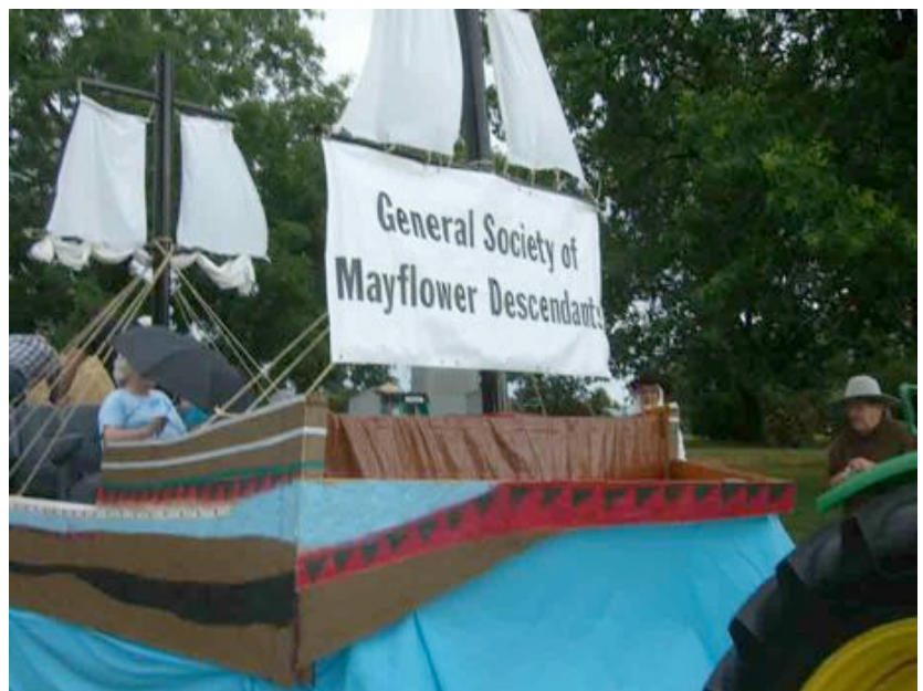
Float constructed by members of the Iowa Mayflower Society, Summer, 2012