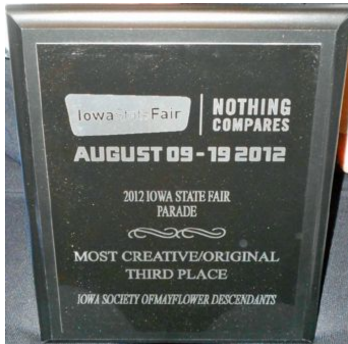
Award presented to Iowa Mayflower Society, Wednesday, August 9, 2012 for Third Place – Most Creative//Original Float